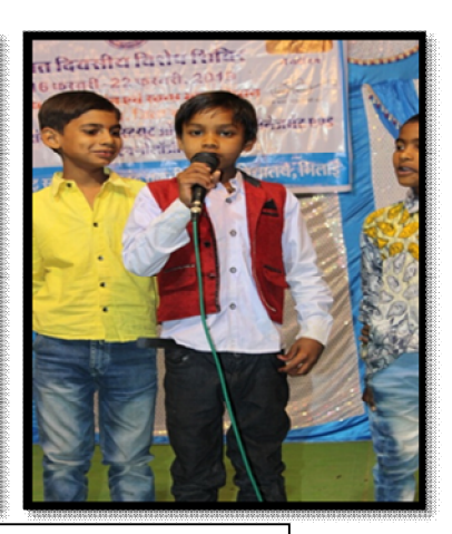
Cultural Events in Evening

Also few of the members of NSS team made a Paint Rangoli of NSS logo which got dry by evening.