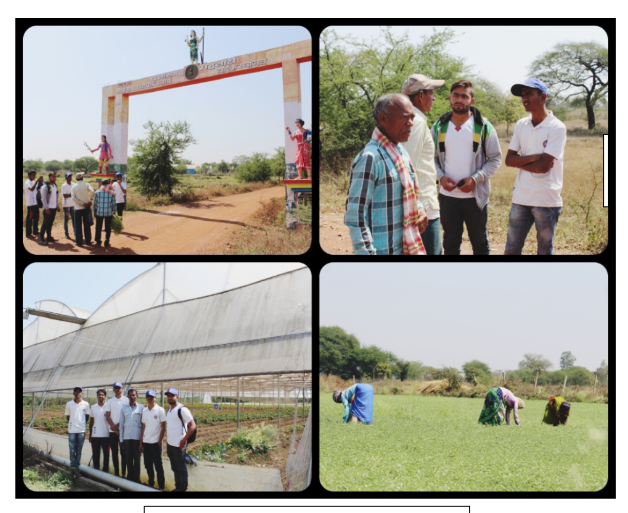
Surveying team with Village Farmers & localities

Meanwhile another team of few boys volunteers went to different areas of villages and surveyed about how NSS has worked and are they happy with what NSS has bought the change in village. Palaud being the adopted village of SSIPMT is itself of special importance and thus NSS Cell, SSIPMT always ensures that villagers are satisfied and happy with their work.