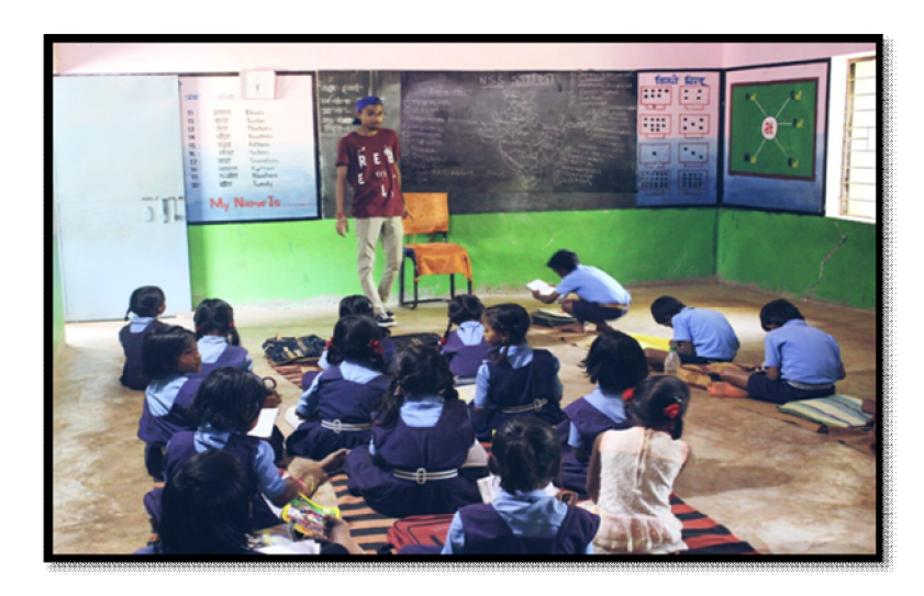
2<sup>nd</sup> std. students learning how to draw Indian Map

The day began with Prabhat Pheri followed by Yoga and Shramdan in which all the NSS volunteers enthusiastically took part. Today the main task of students after Breakfast was to prepare themselves for the nukkad and meanwhile they were grouped into teams who went for Teaching the students in school and also another team held Sports competition among all the students after taking permission from school Principal.