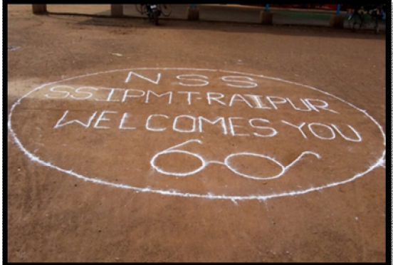
Preparations being done by NSS Volunteers with Full Enthusiasm

On the very first day of camp no cultural events were held in the evening as all the villagers along with NSS Volunteers paid tribute to all our brave soldiers who lost their lives in attack of Pulwama on 14th February.