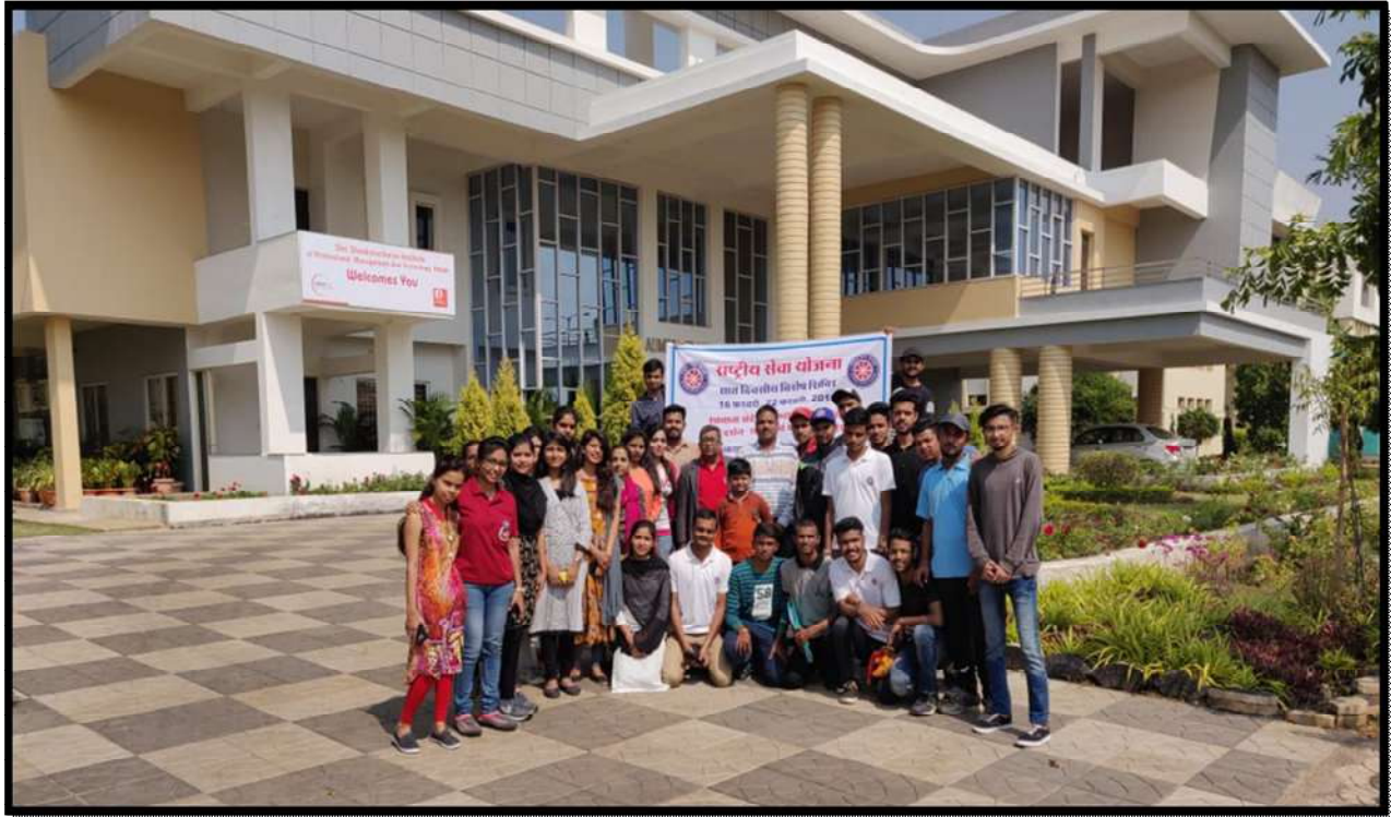
NSS Team Departs from SSIPMT Campus