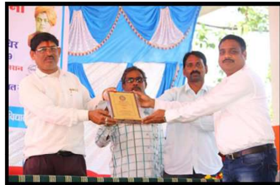
Momento Distribution to guests