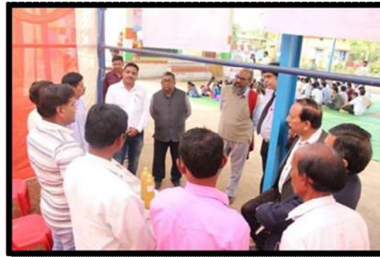
Product Display to Chief Guests by SLRM