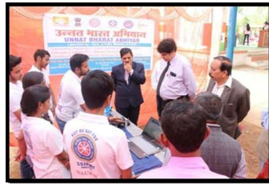
Technical Team Of NSS Cell,SSIPMT presenting their Technical Models to Chief Guests