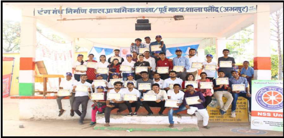
NSS Volunteers after Certificate Distribution

Also the certificate was distributed to the volunteers for their dedicated work in the NSS camp during the whole seven days.