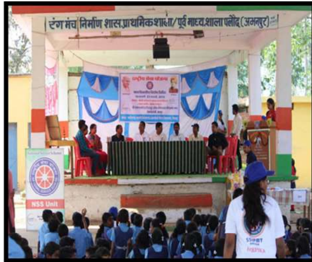
Beginning of Camp Closing Ceremony

After the speech session of all Chief guests, a human chain of Indian Map was formed by NSS Volunteers along with school children in school premises.