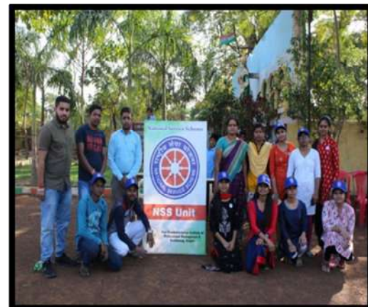
Sports Competition held by NSS Team