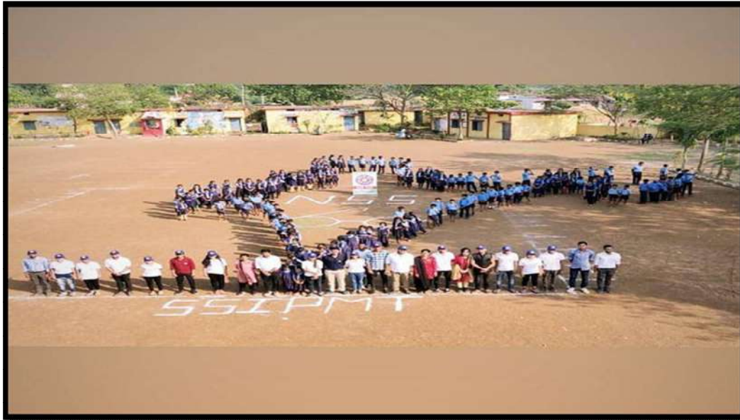
Human Chain formed inside School Campus