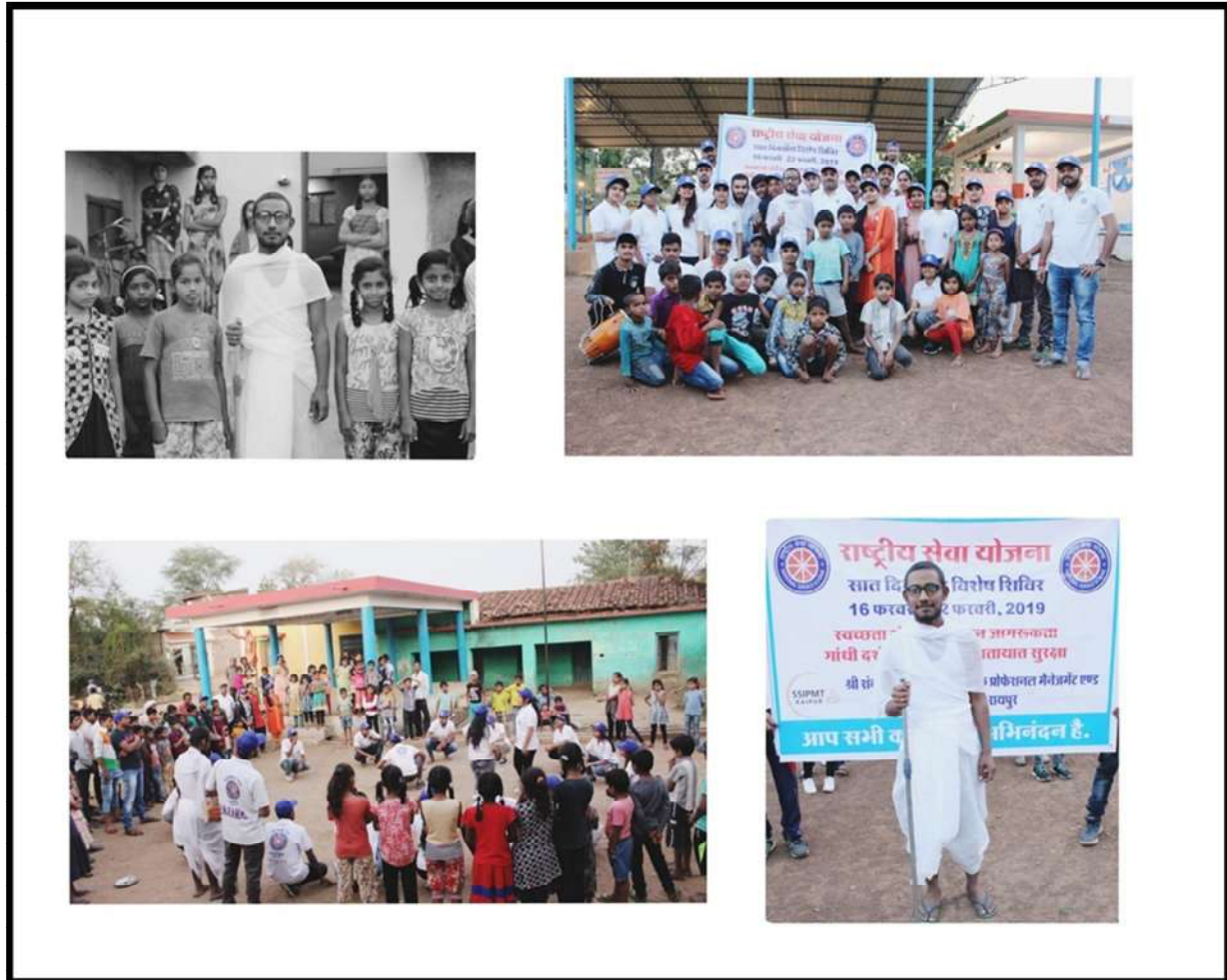
Nukkad Natak performed by NSS Volunteers on GANDHI DARSHAN

After Lunch all the NSS Volunteers were ready for the NUKKAD NATAK to be performed on village squares. So, the team quickly departed after whole preparations.