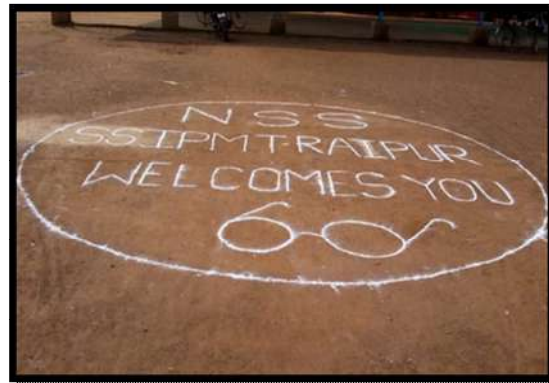
Preparations being done by NSS Volunteers with Full Enthusiasm

On the very first day of camp no cultural events were held in the evening as all the villagers along with NSS Volunteers paid tribute to all our brave soldiers who lost their lives in attack of Pulwama on 14th February.