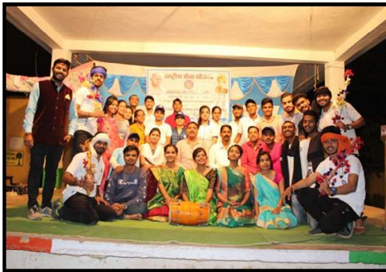
NSS girls and boys Dance team along with their Program Officer after the event