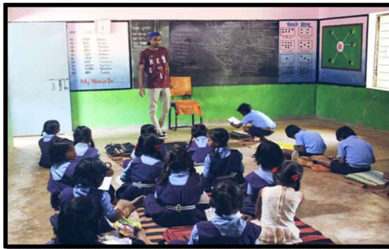
2 nd std. students learning how to draw Indian Map

The day began with Prabhat Pheri followed by Yoga and Shramdan in which all the NSS volunteers enthusiastically took part. Today the main task of students after Breakfast was to prepare themselves for the nukkad and meanwhile they were grouped into teams who went for Teaching the students in school and also another team held Sports competition among all the students after taking permission from school Principal.