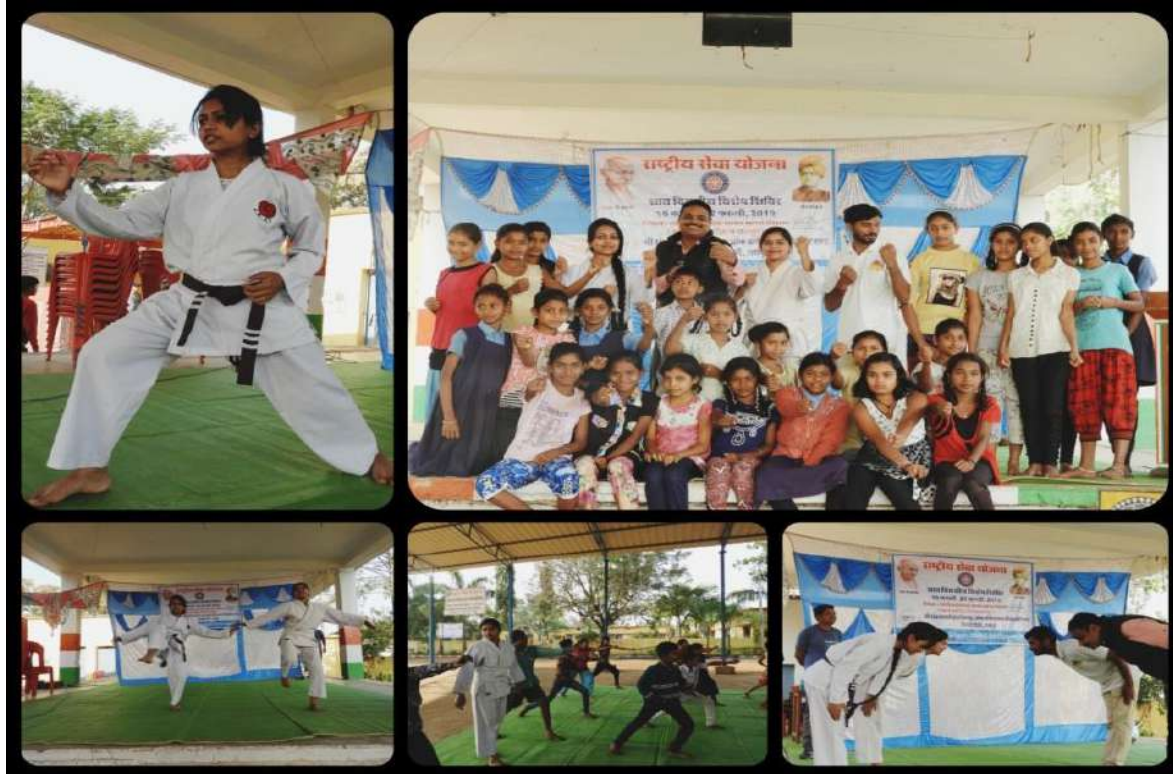
Judo Karate Sessions