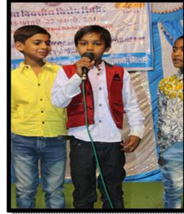
Cultural Events in Evening

Also few of the members of NSS team made a Paint Rangoli of NSS logo which got dry by evening.