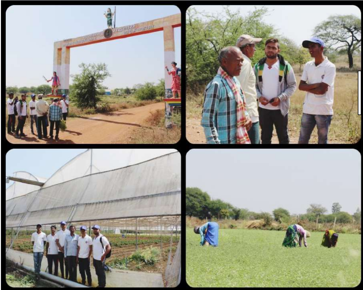
Surveying team with Village Farmers & localities

Meanwhile another team of few boys volunteers went to different areas of villages and surveyed about how NSS has worked and are they happy with what NSS has brought the change in village. Palaud being the adopted village of SSIPMT is itself of special importance and thus NSS Cell, SSIPMT always ensures that villagers are satisfied and happy with their work.