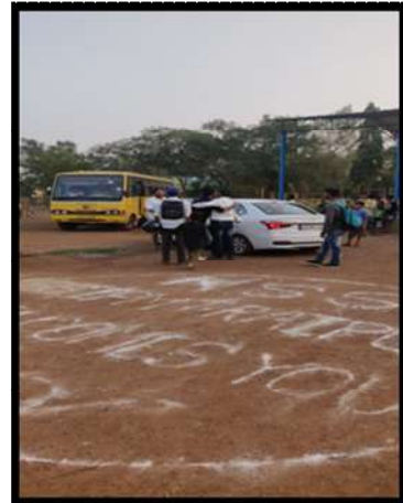
Departure from Camp