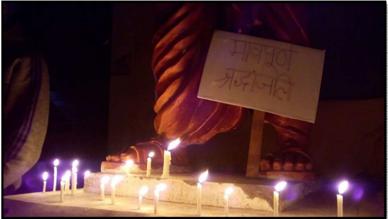
TRIBUTE TO OUR BRAVE SOLDIERS ON PULWAMA ATTACK