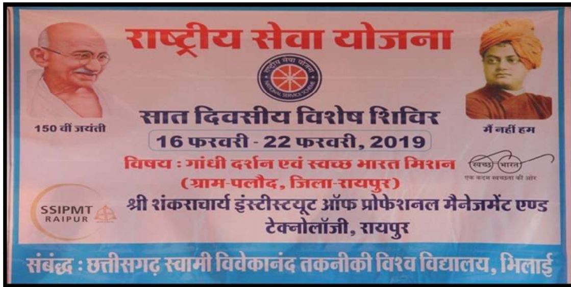
NSS Camp 2019 Banner

Consecutively for the third year SSIPMT continues its tradition of organizing 7 days camp at village Palaud (Abhanpur). This year too the camp successfully began on 16th February, 2019, with the subject of “GANDHI DARSHAN and SWACHHBHARAT MISSION”.