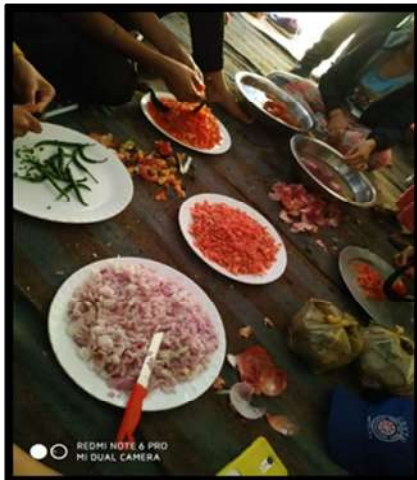
Preparation of Breakfast

Meanwhile breakfast was being prepared by another team.