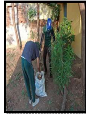
Shramdaan by NSS Volunteers

Meanwhile breakfast was being prepared by another team.