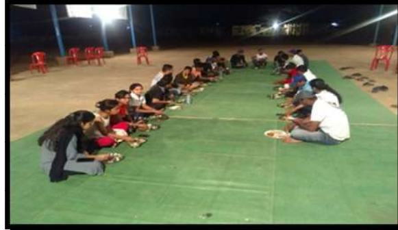
Volunteers having Dinner Together