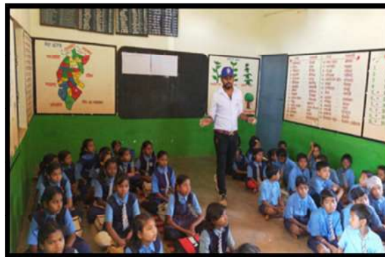
NSS Volunteers Telling students about Gandhiji and asking questions