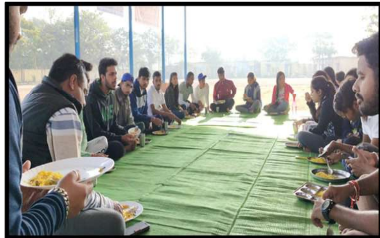
NSS Team Having Breakfast together