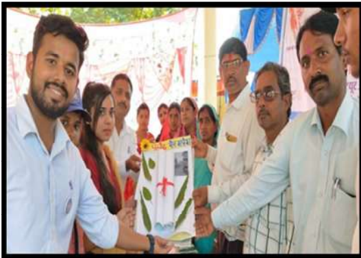
“Palaud Express” being presented to the guests by the team