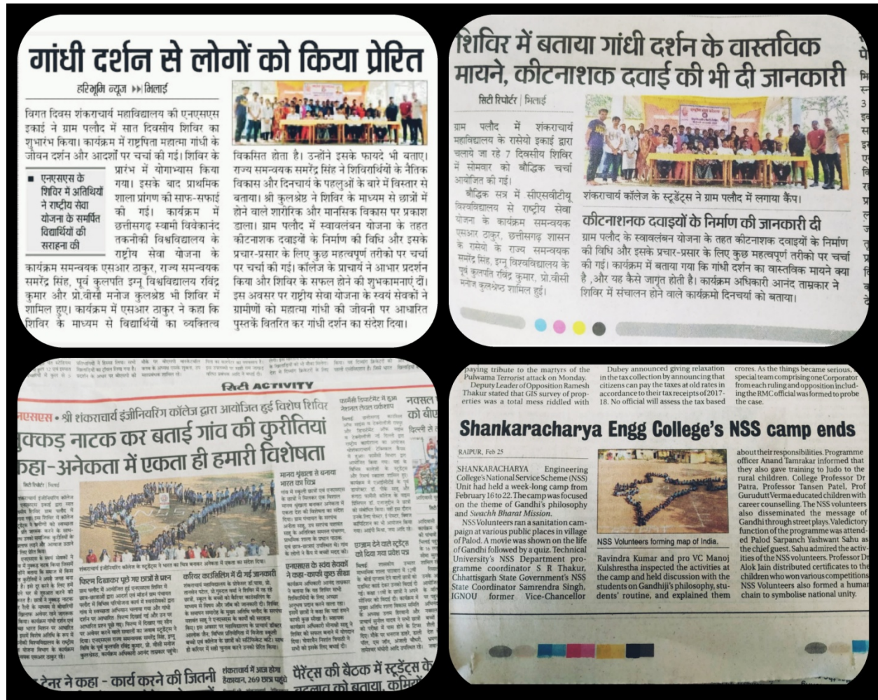
NSS Camp of SSIPMT in Headlines

This year the seven days camp of NSS Cell,SSIPMT at Palaud was able to hit the headlines of newspapers like The Hitavada,Dainik Bhaskar, Haribhoomi, Navbharata etc.