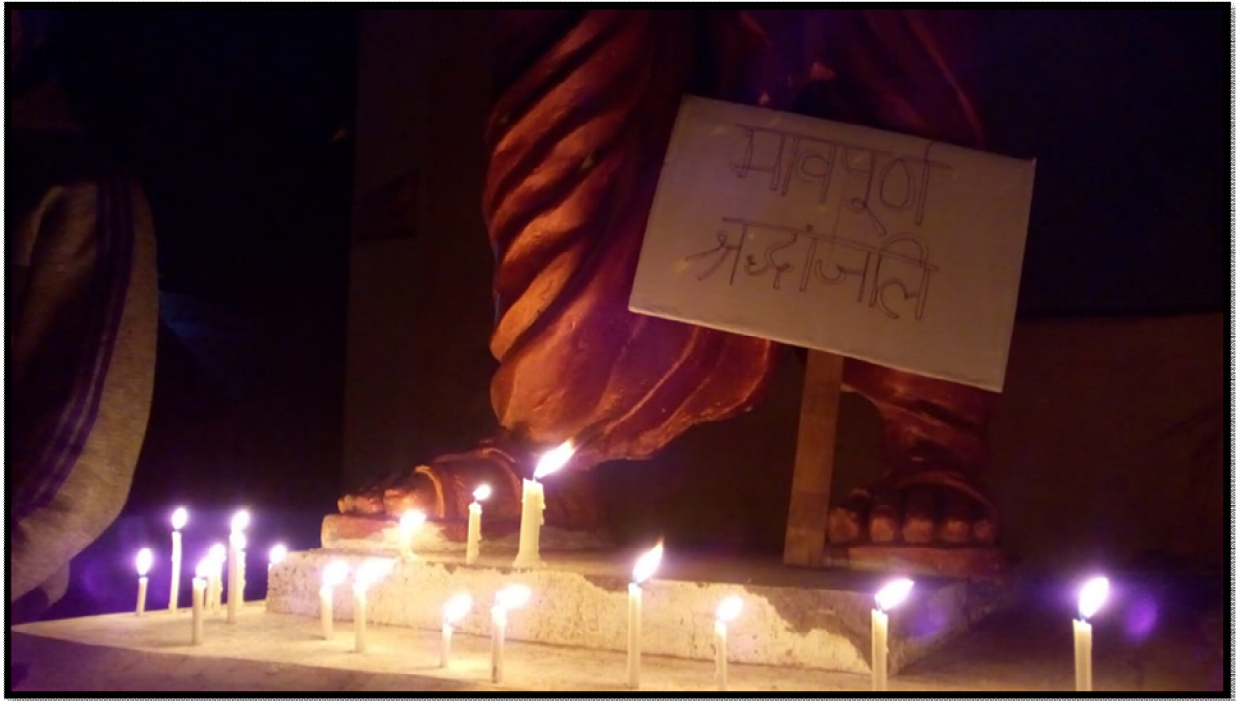
TRIBUTE TO OUR BRAVE SOLDIERS ON PULWAMA ATTACK