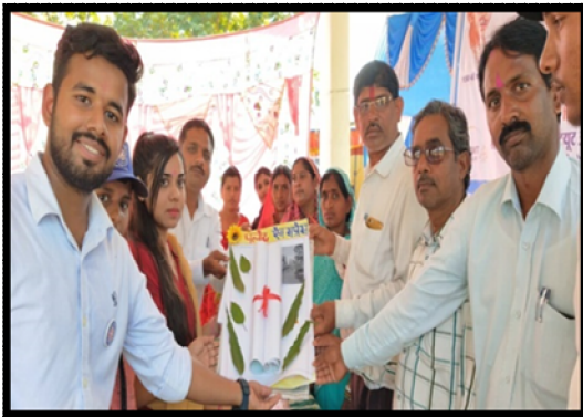
“Palaud Express” being presented to the guests by the team