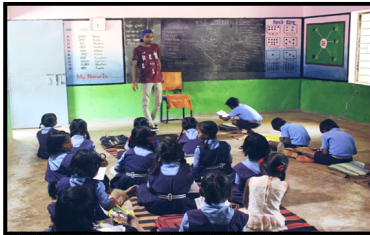
2 nd std. students learning how to draw Indian Map

The day began with Prabhat Pheri followed by Yoga and Shramdan in which all the NSS volunteers enthusiastically took part. Today the main task of students after Breakfast was to prepare themselves for the nukkad and meanwhile they were grouped into teams who went for Teaching the students in school and also another team held Sports competition among all the students after taking permission from school Principal.