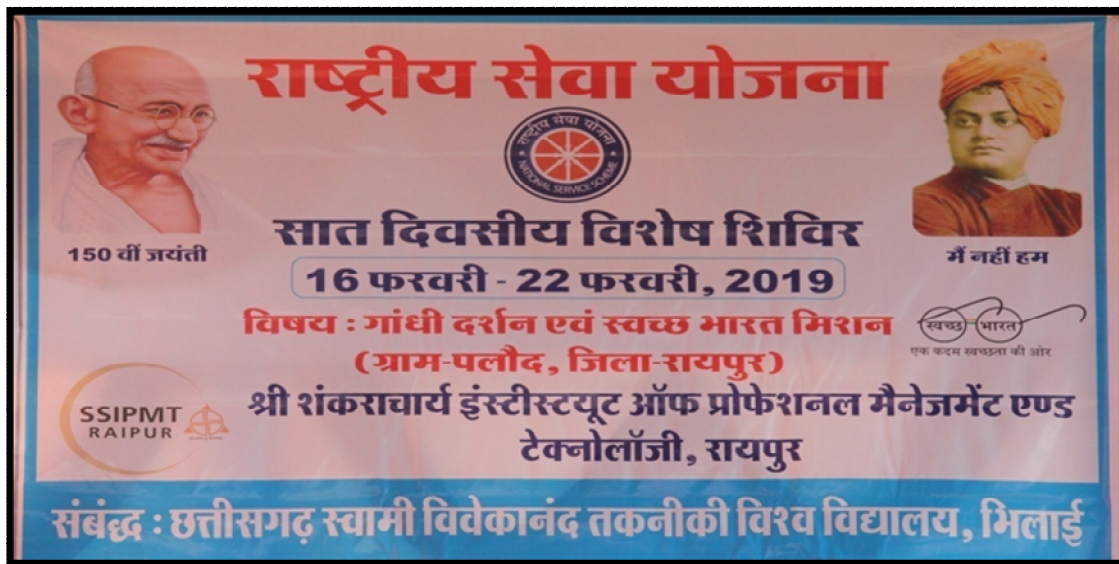
NSS Camp 2019 Banner

Consecutively for the third year SSIPMT continues its tradition of organizing 7 days camp at village Palaud (Abhanpur). This year too the camp successfully began on 16th February, 2019, with the subject of “GANDHI DARSHAN and SWACHHBHARAT MISSION”.