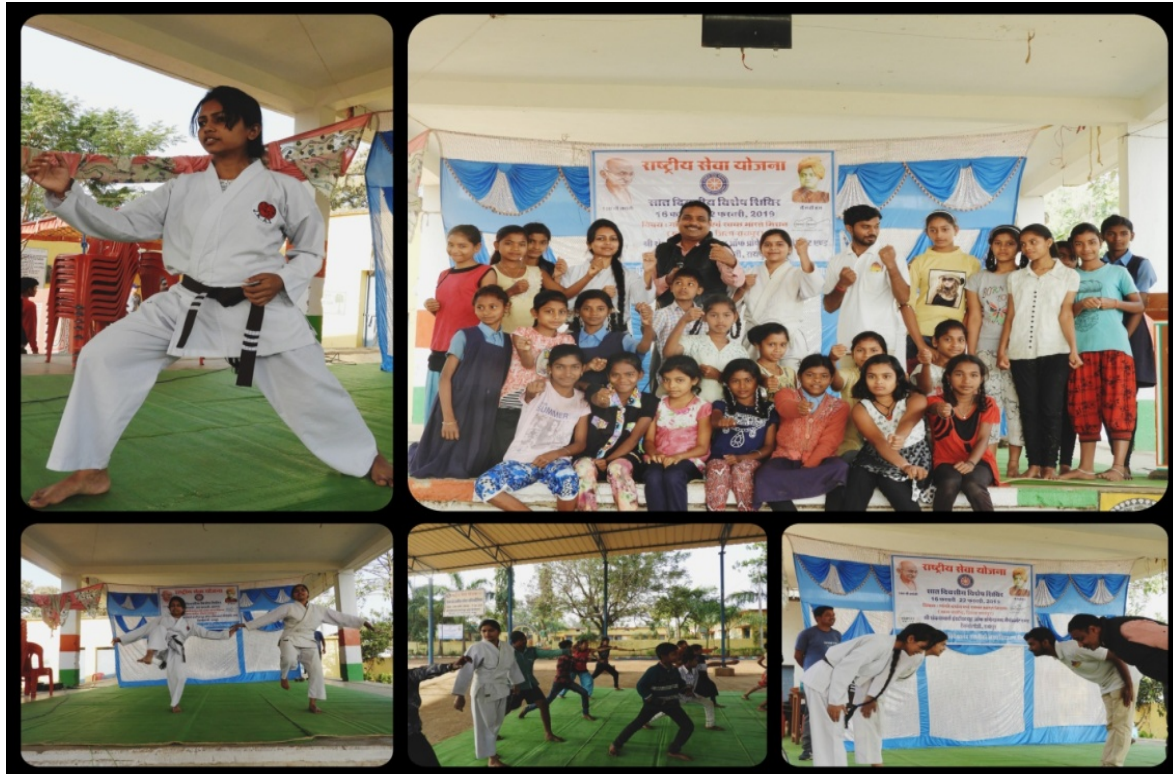
Judo Karate Sessions