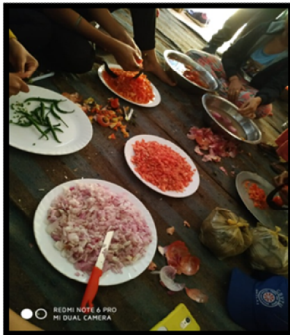
Preparation of Breakfast

Meanwhile breakfast was being prepared by another team.