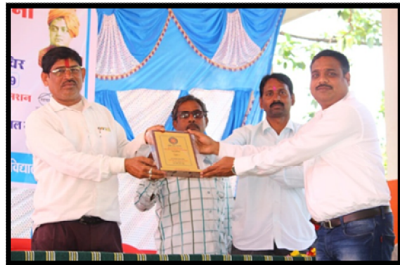
Momento Distribution to guests