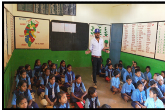
NSS Volunteers Telling students about Gandhiji and asking questions