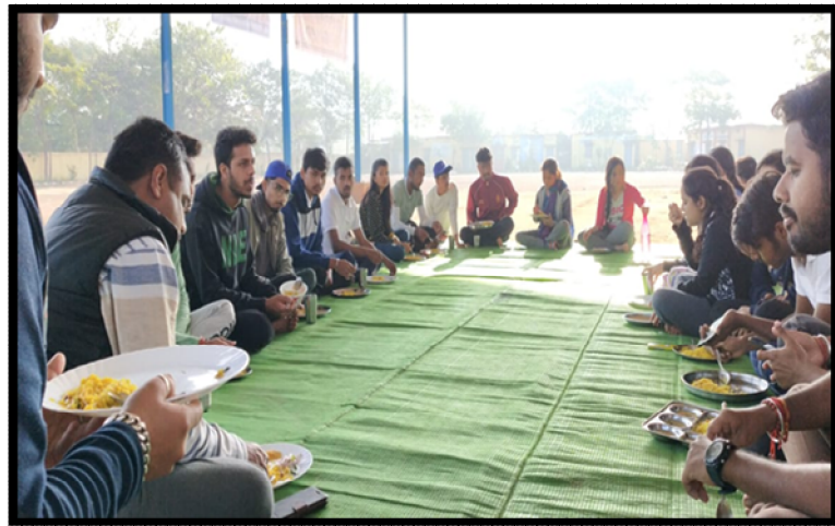
NSS Team Having Breakfast together