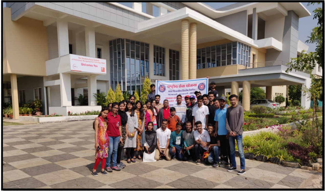
NSS Team Departs from SSIPMT Campus