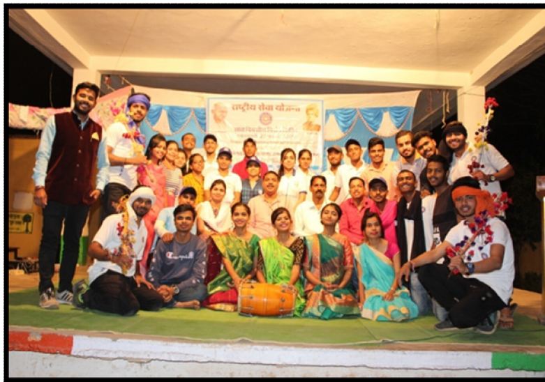
NSS girls and boys Dance team along with their Program Officer after the event