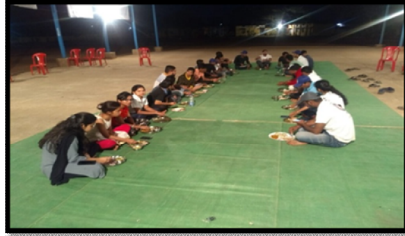
Volunteers having Dinner Together