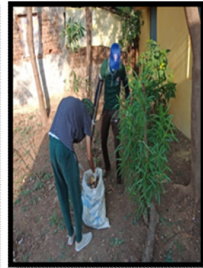
Shramdaan by NSS Volunteers

Meanwhile breakfast was being prepared by another team.