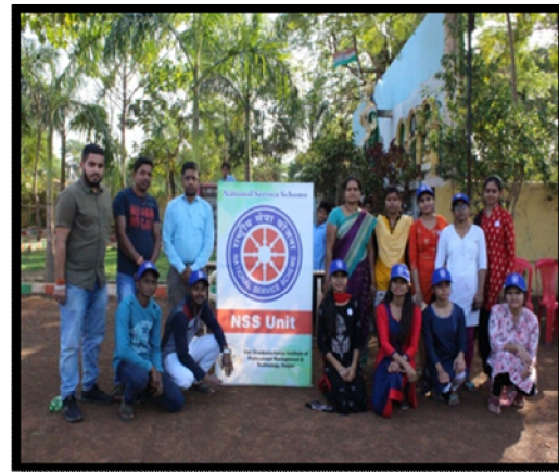
Sports Competition held by NSS Team