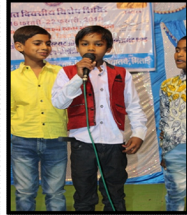
Cultural Events in Evening

Also few of the members of NSS team made a Paint Rangoli of NSS logo which got dry by evening.