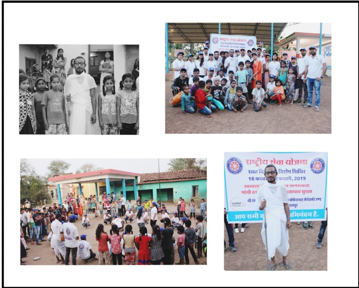
Nukkad Natak performed by NSS Volunteers on GANDHI DARSHAN

After Lunch all the NSS Volunteers were ready for the NUKKAD NATAK to be performed on village squares. So, the team quickly departed after whole preparations.