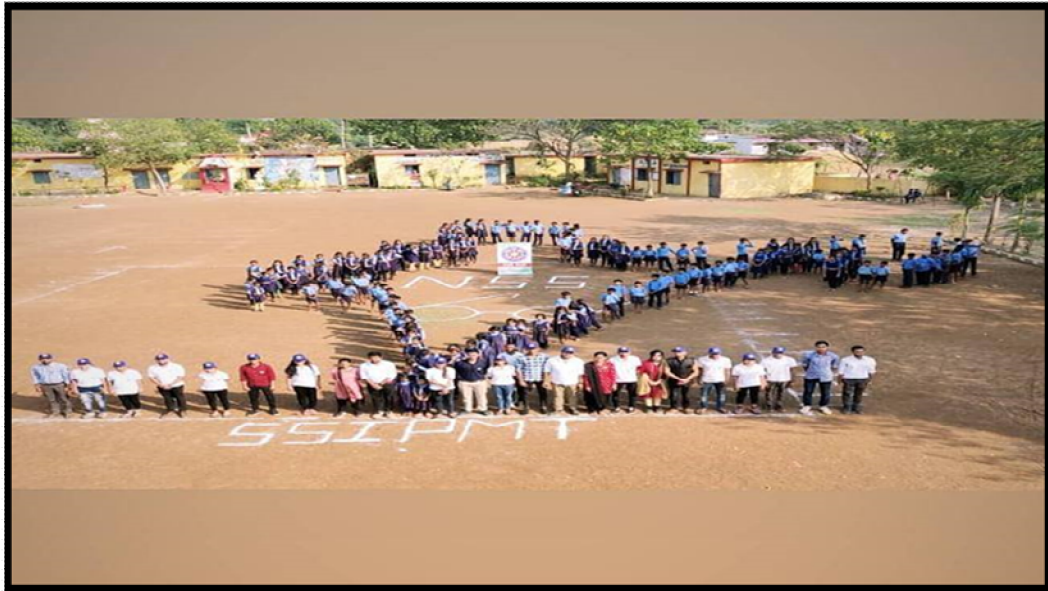
Human Chain formed inside School Campus