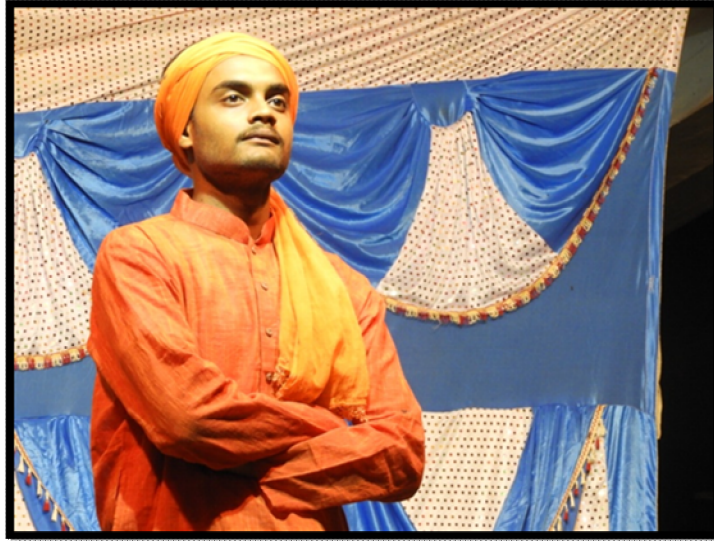
NSS Volunteer as Swami Vivekananda

In the evening a Nukkad Natak on SWAMI VIVEKANANDA based on inspiring youth of Village was done by NSS Team.