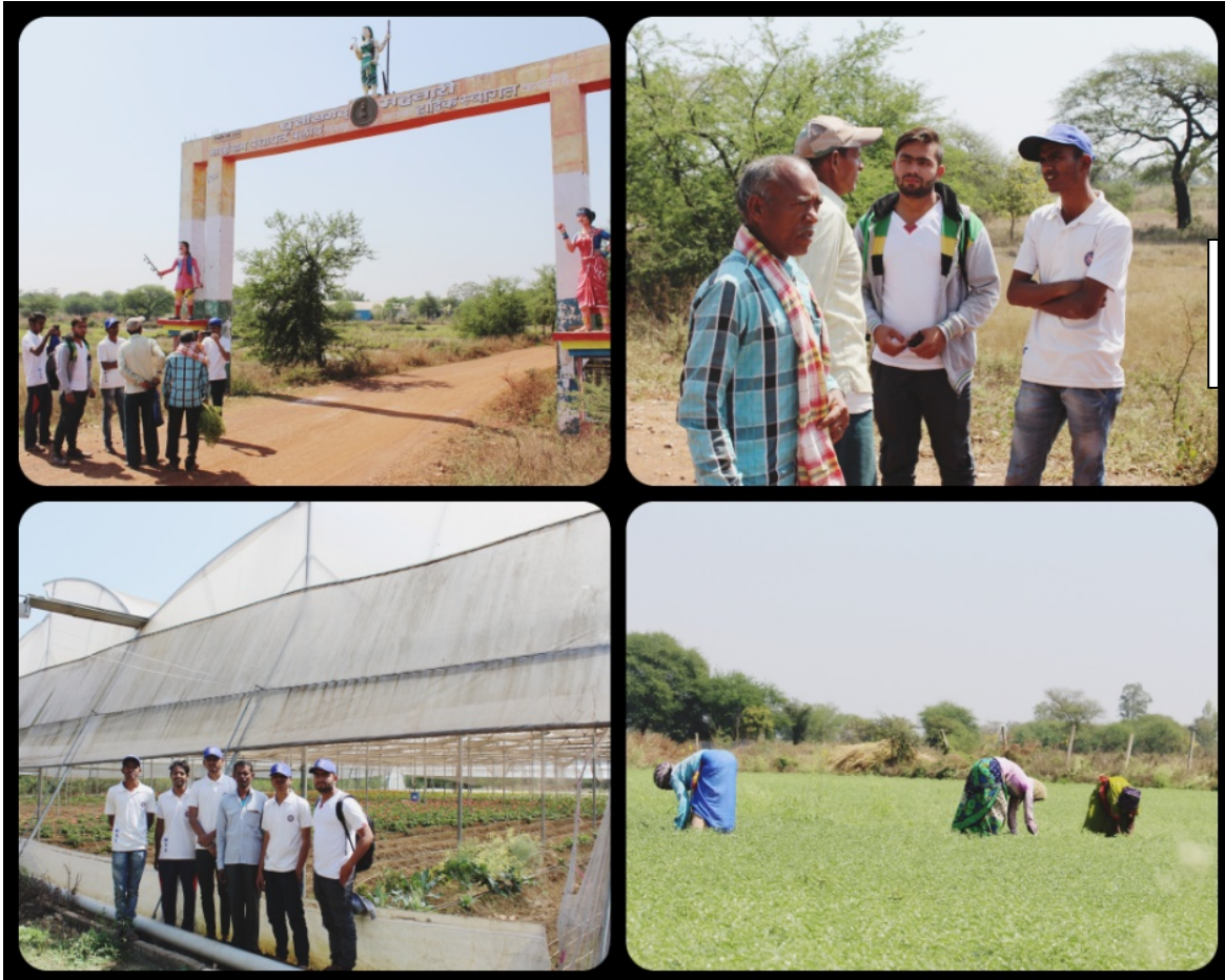
Surveying team with Village Farmers & localities

Meanwhile another team of few boys volunteers went to different areas of villages and surveyed about how NSS has worked and are they happy with what NSS has brought the change in village. Palaud being the adopted village of SSIPMT is itself of special importance and thus NSS Cell, SSIPMT always ensures that villagers are satisfied and happy with their work.