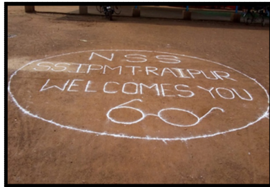
Preparations being done by NSS Volunteers with Full Enthusiasm

On the very first day of camp no cultural events were held in the evening as all the villagers along with NSS Volunteers paid tribute to all our brave soldiers who lost their lives in attack of Pulwama on 14th February.