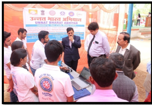
Technical Team Of NSS Cell,SSIPMT presenting their Technical Models to Chief Guests