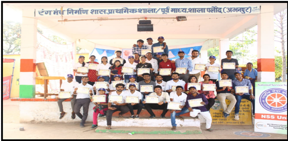
NSS Volunteers after Certificate Distribution

Also the certificate was distributed to the volunteers for their dedicated work in the NSS camp during the whole seven days.