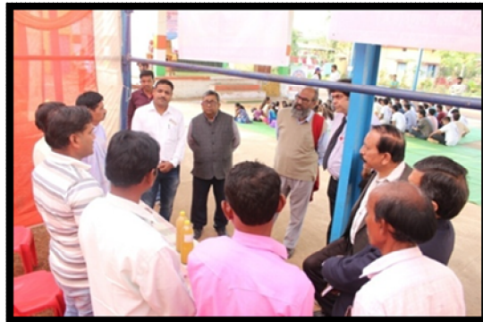
Product Display to Chief Guests by SLRM