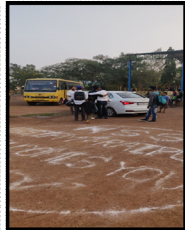
Departure from Camp