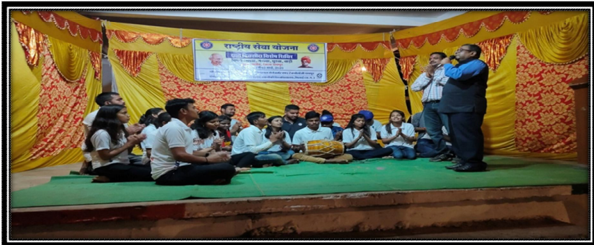
Honorable Principal sir with NSS volunteers