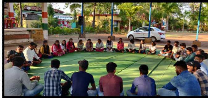
Preparations being done by NSS Volunteers with Full Enthusiasm