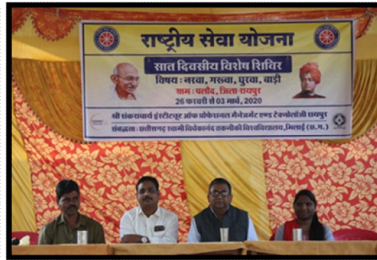
Inaugural Ceremony at stage of Govt. School,Palaud Village

With the end of ceremony NSS Volunteers quickly began their preparations for the next day in the discussion of first meeting with Program Officer. Tasks were listed and divided among the volunteers.