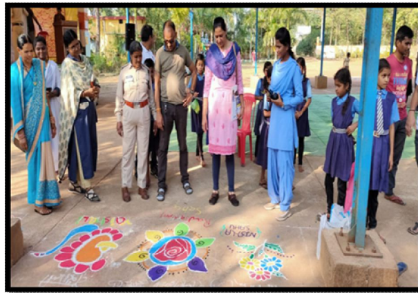
Judgement by Guests on Rangoli Competition