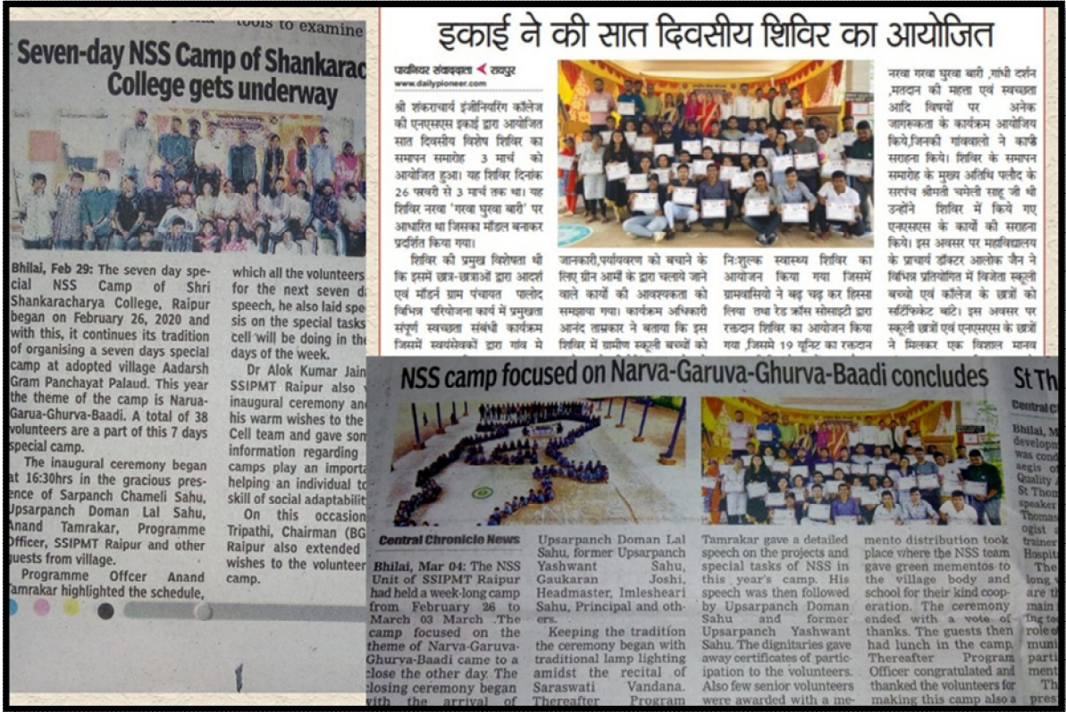
NSS Camp 2020 of SSIPMT in Headlines