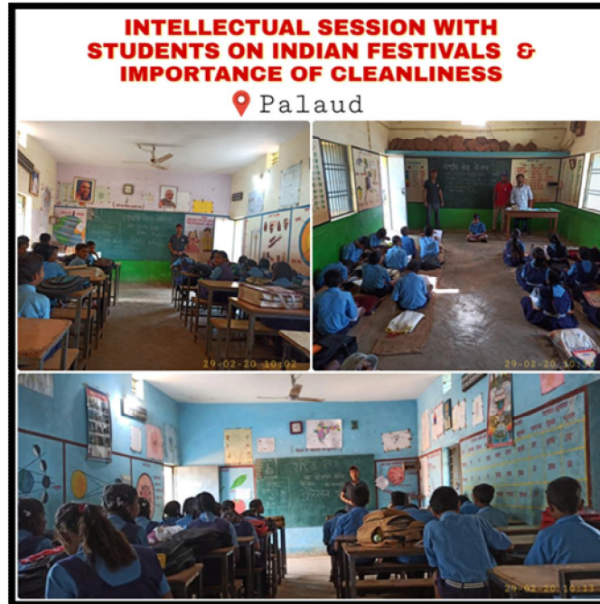
Intellectual Session followed by Handwriting Competition