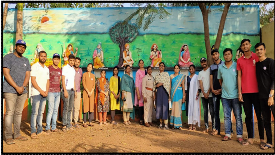
Group Photo with the guests