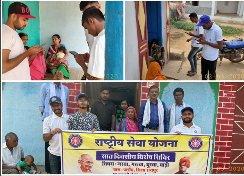
NSS VOLUNTEERS DOING SURVEY IN DIFFERENT WARDS OF VILLAGE PALAUD