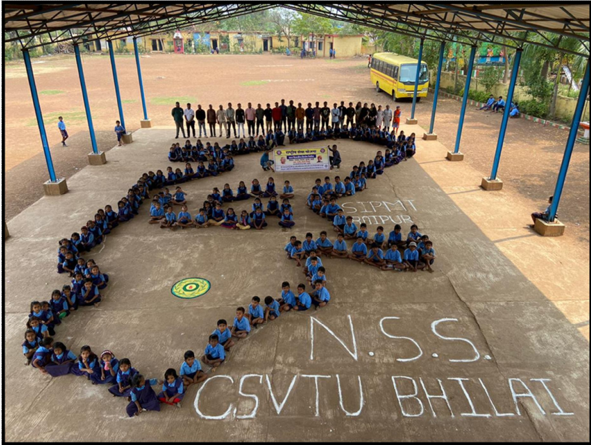
Human Chain formed inside School Campus

The closing ceremony concluded with the momento distribution to the chief guest.