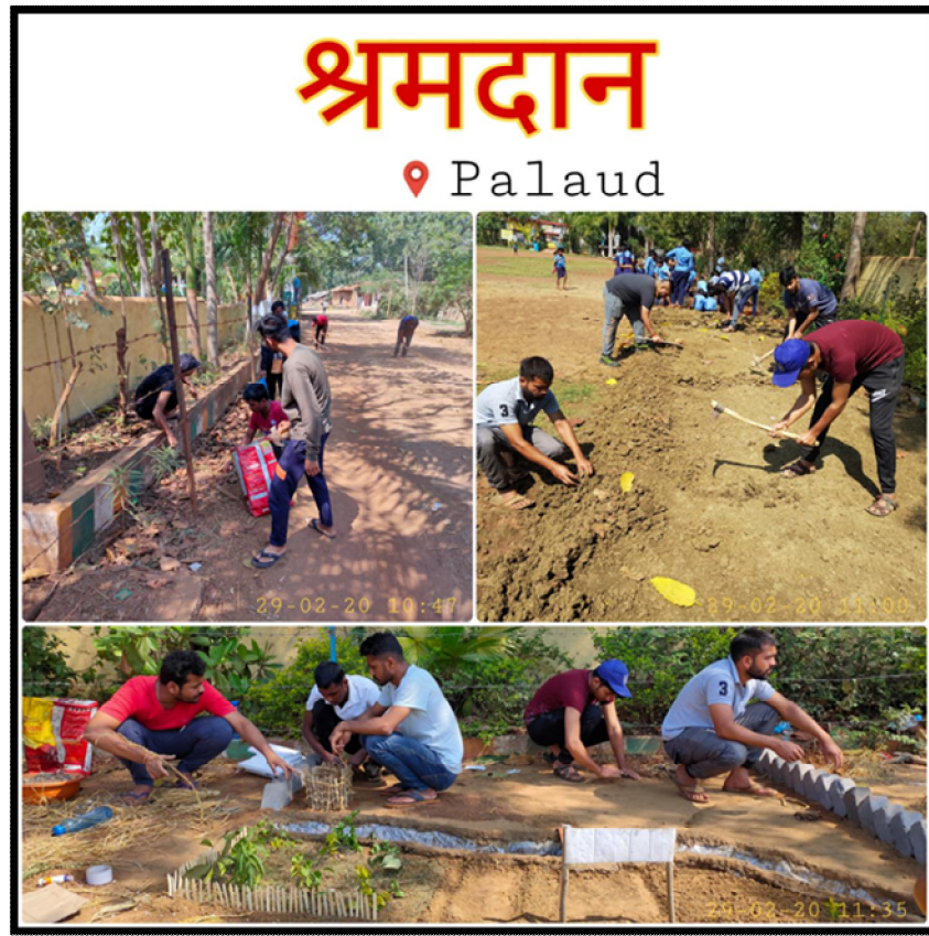
Shramdan and Garden Cultivation

This was followed by a handwriting competition coordinated by volunteers of NSS SSIPMT Raipur.