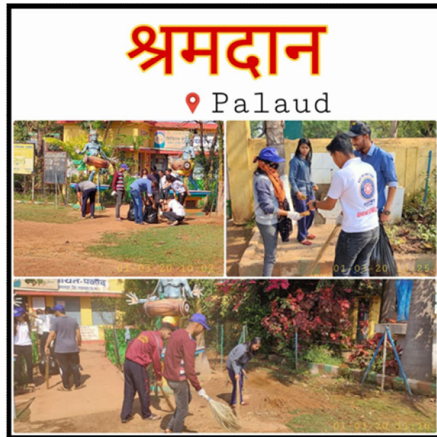
Shramdan by volunteers

On another vibrant day the team made itself ready for the series of events after having a session of sound meditation to relax their minds, followed by shramdan.