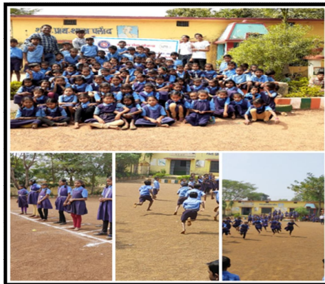
Games organized by NSS Volunteers